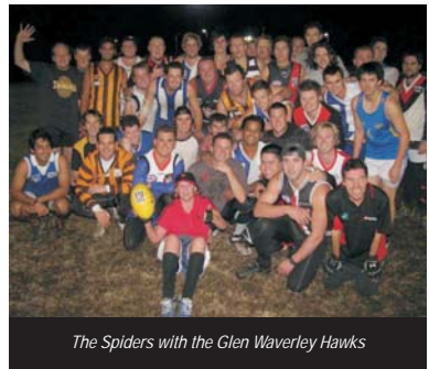
The Spiders with the Glen Waverley Hawks